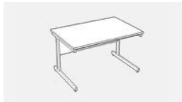
EV16 Cantilever workstation

We understand the need for some privacy, so this robust and durable desking range not only comes with a cantilever leg system but also fitted internal modesty panels.