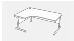
EV1612L Radial cantilever workstation, left aligned