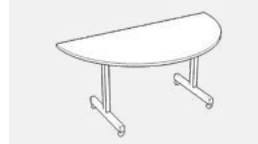
FLIP-D Semicircle top