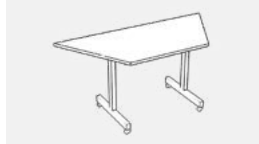
FLIP-T Trapezoidal top