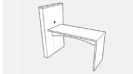
GAWMU18 Media unit with poseur table

With a practical yet playful design, Gather gives you a contemporary colour palette that can blend in or stand out within your interior scheme. This range of is designed to bring teams together in a mix of settings.