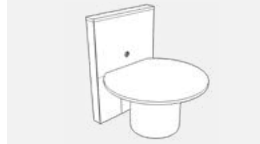
GAWMUC13 Round Media unit